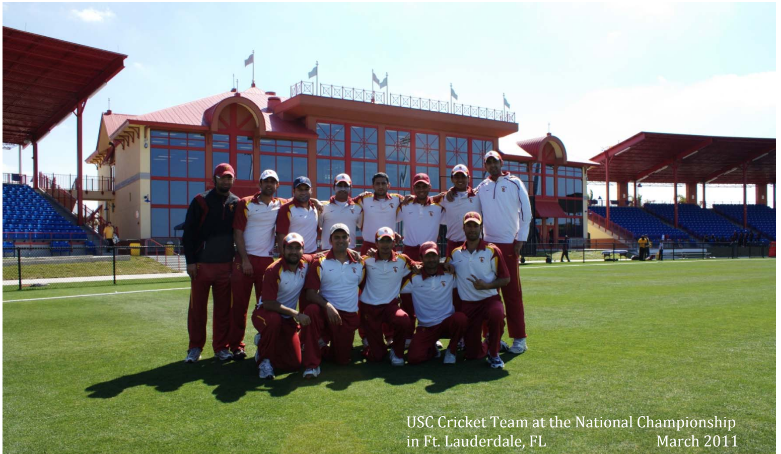
USC Cricket Team at the National Championship in Ft. Lauderdale, FL March 2011